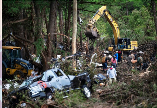
First responders carry out search and rescue operations Monday near the Guadalupe River after a flash flood swept through Injram, Texas.