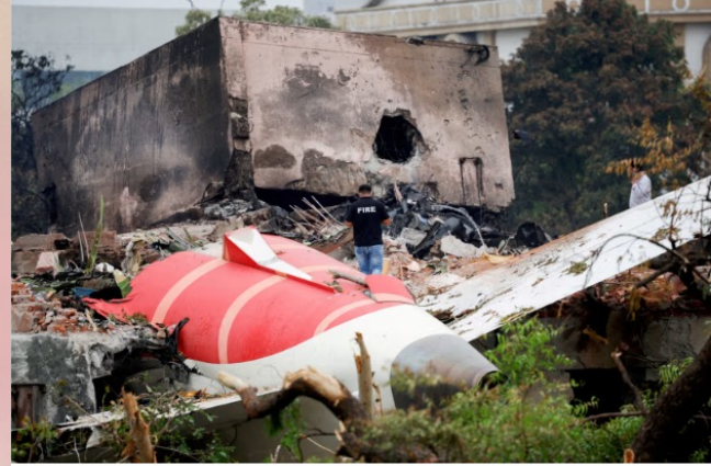
The wreckage of the Air India Boeing 787 Dreamliner in Ahmedabad, India.