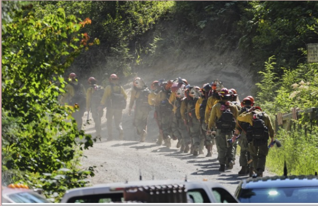
A line of wildland firefighters arrive at the scene the day after a shooter ambushed and killed multiple firefighters who were responding to a wildfire he set at Canfield Mountain on Monday, in Coeur D'Alene, Idaho.